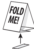
Table | Desk Reminder Sign Fold Tabs 1 and 2 under and tape in place. Display during the 12 Habits month ©2021 All of Us, Inc., All rights reserved. For more information: call 814.779.2060 or visit 12Habits4AllOfUs.org WORKS!