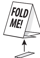
Table | Desk Reminder Sign Fold Tabs 1 and 2 under and tape in place. Display during the 12 Habits month ©2021 All of Us, Inc., All rights reserved. For more information: call 814.779.2060 or visit 12Habits4AllOfUs.org WORKS!