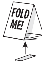
Table | Desk Reminder Sign Fold Tabs 1 and 2 under and tape in place. Display during the 12 Habits month ©2021 All of Us, Inc., All rights reserved. For more information: call 814.779.2060 or visit 12Habits4AllOfUs.org WORKS!